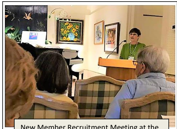
New Member Recruitment Meeting at the Municipal Art Gallery September 9, 2017.

* Unless otherwise noted, all board meeting will be at 6:00 p.m. in the Conference Room of the Mississippi Department of Agriculture and Commerce, 121 N. Jefferson St., Jackson. All meetings are open to the