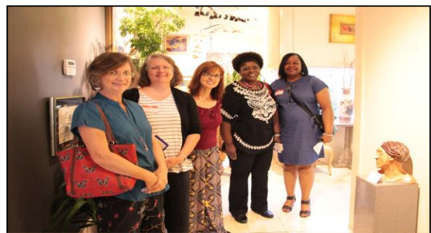
LWV-MS Members Enjoy Art Exhibit